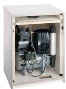
Soundproof cabinet, small