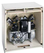
Soundproof cabinet, large