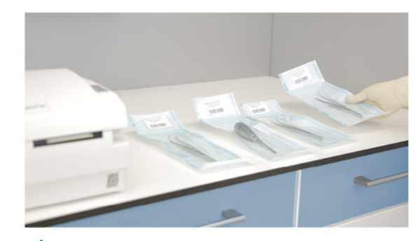
✓ Labelling with MELAprint 60