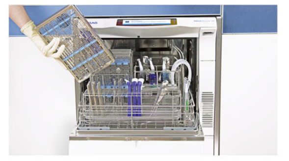
✓ Cleaning & disinfection with MELA therm