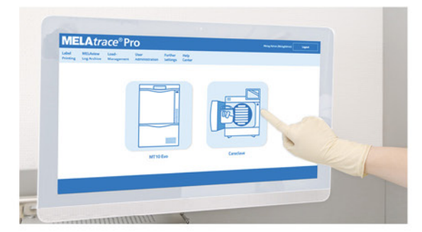
✓ Documentation & approval with MELAtrace