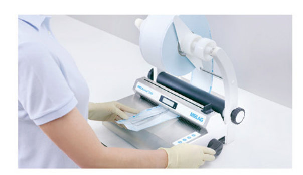
✓ Packaging with MELA seal or MELA store