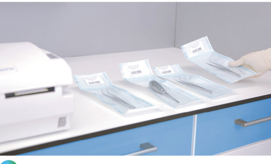
Marking with MELAprint<sup>®</sup> 60

Process-optimized: Coordinated operating concept to avoid malfunctions in everyday practice